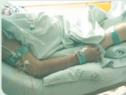
Securing of infusion cannulae, catheters and arterial sphygmomanometers