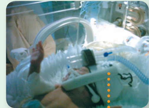
In support of respiration with CPAP-masks – closure of the mouth with Soft-Fix small