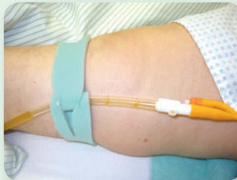
Securing of urinary catheters or in dialysis