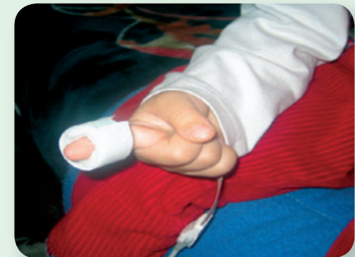
Fixation of pulse oxymeters by ambulatory care nursing of children