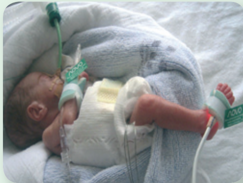
Securing of charging and discharging tube systems as well as saturation tubes for premature infants and babies