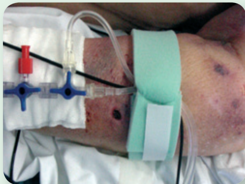
Securing of venous drainages and infusion cannulae applied to parchment-like skin.