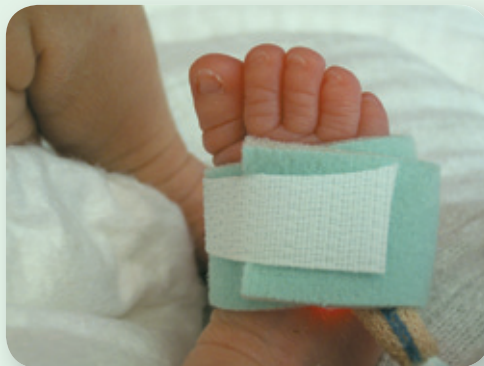
Fast and skin-friendly fixation of saturation tubes