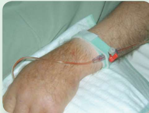
Securing and padding of charges and discharges