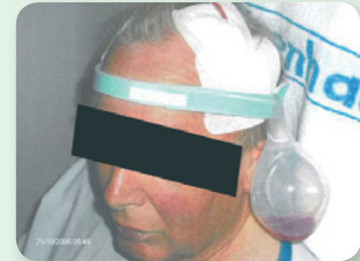
Securing of ventricular drainages