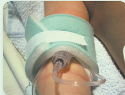
Securing and cushioning of tube systems