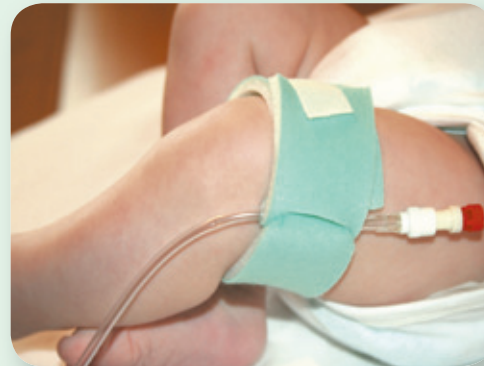
Securing and cushioning of tubes and cannulae, e.g. femoral catheters or arterial accesses by using a Soft-Fix loop