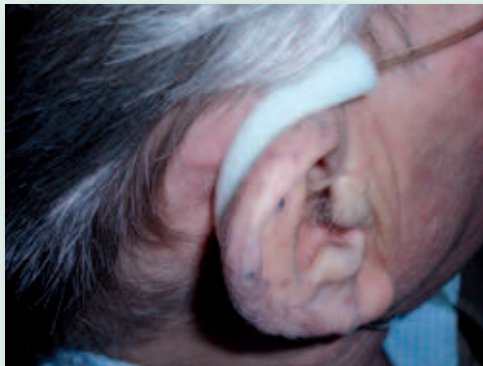
Oxy-Care used in Home Care

This padding protects the skin around the ear against pressure marks and irritation caused by nasal cannulae.