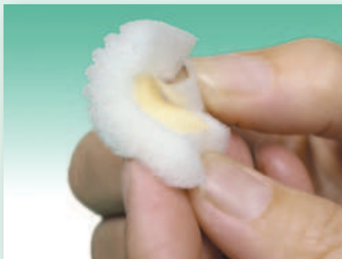
Ute-Fix 2 (small)

In prophylactic use it protects the skin against pressure marks or excoriation using suprapubic and transurethral catheters as well as sundry tube systems.